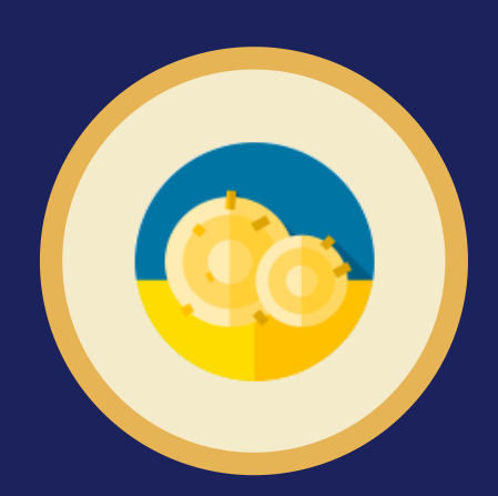
THEY ADDED HAY FOR INSULATION...