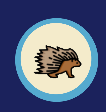
FREDDIE PLEADED FOR SHELTER IN THE WARREN!