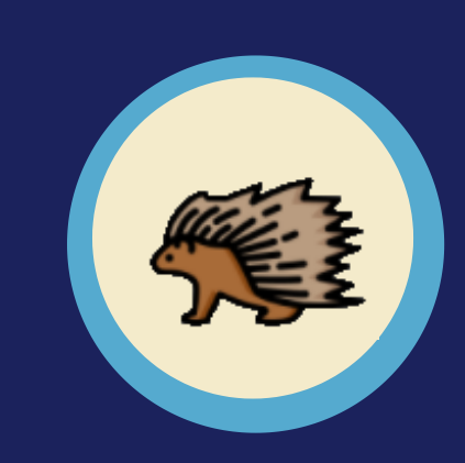
BUT FREDDIE Was NOT :-(