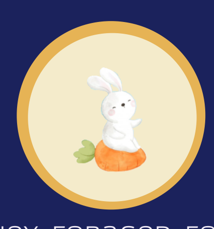
THEY FORAGED FOR extra food...

ONCE UPON A TIME... A FAMILY OF RABBITS, UPON Reading the Latest Animal's ALMANAC, DECIDED TO PREPARE ahead for what was predicted TO BE A BRUTAL WINTER.